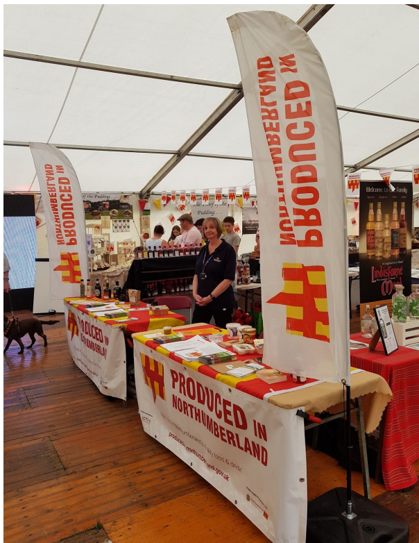
Photograph taken at the 'Northumberland County Show' 28 May 2018

From feedback at events the public have been really positive about the scheme as it allows them to make an informed decision when purchasing food and gives them confidence that the food they buy has truly been 'Produced in Northumberland'. At Hexham market on 12 September 2018 the scheme was show cased to HRH The Prince of Wales.