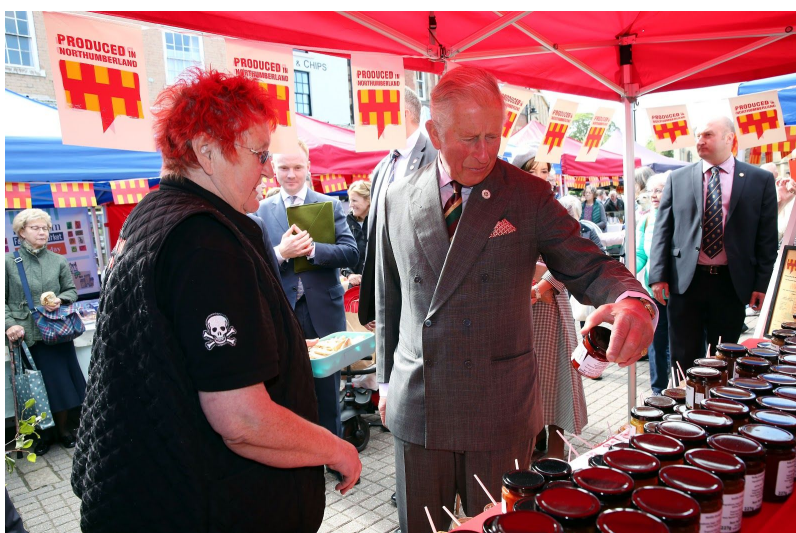
Photograph taken at the 'Hexham Market Showcase' 12 September 2018

From feedback at events the public have been really positive about the scheme as it allows them to make an informed decision when purchasing food and gives them confidence that the food they buy has truly been 'Produced in Northumberland'. At Hexham market on 12 September 2018 the scheme was show cased to HRH The Prince of Wales.