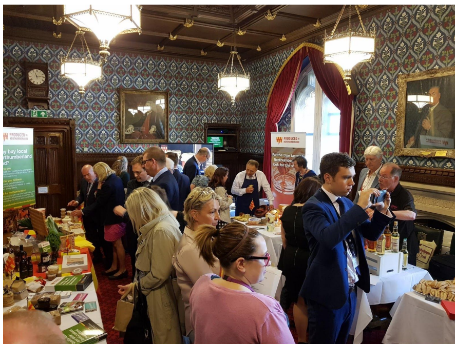
Photograph taken at Parliament, London, 13th June 2018.

The benefits and importance of the scheme have been recognised at a local and national level, culminating in a visit to the Houses of Parliament on 13 June 2018. This saw the 'Produced in Northumberland' scheme being showcased to MP's and government ministers who were able to find out more about the fantastic local businesses and top quality produce that is available from Northumberland. Eight business members of the scheme attended the event showcasing their local food products.